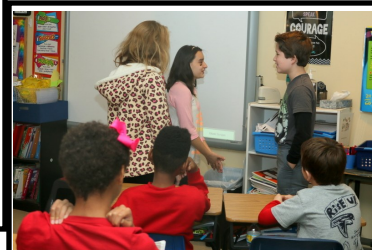
Role playing possible solutions to feeling left out of a conversation during Social-Emotional Learning class