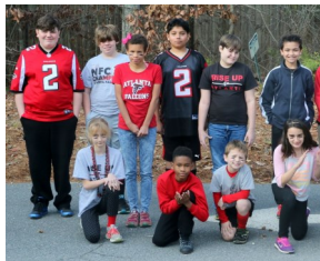
Superbowl Fun on Friday